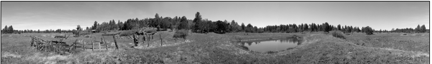
Pine Ranch, Grand Canyon-Parashant National Monument, HALS AZ-4