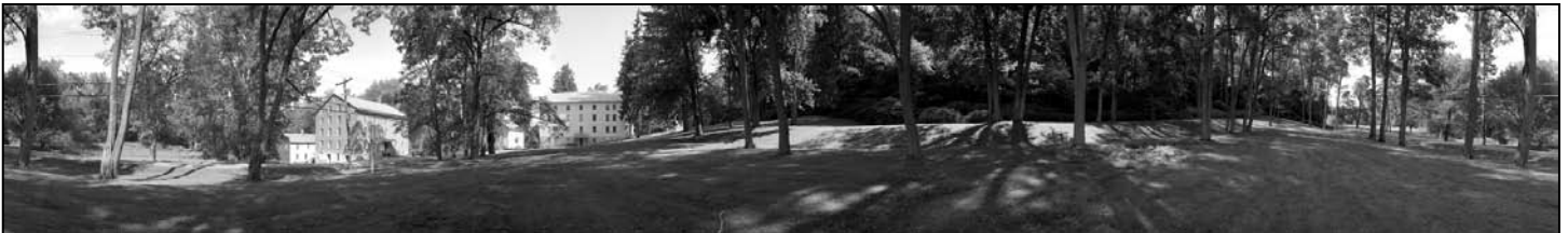
North Family, Mount Lebanon Shaker Village, HALS NY-7

www.nps.gov/nr/publications/bulletins/nrb18/ www.nps.gov/history/nr/publications/bulletins/nrb30/ www.nps.gov/history/hps/TPS/briefs/brief36.htm